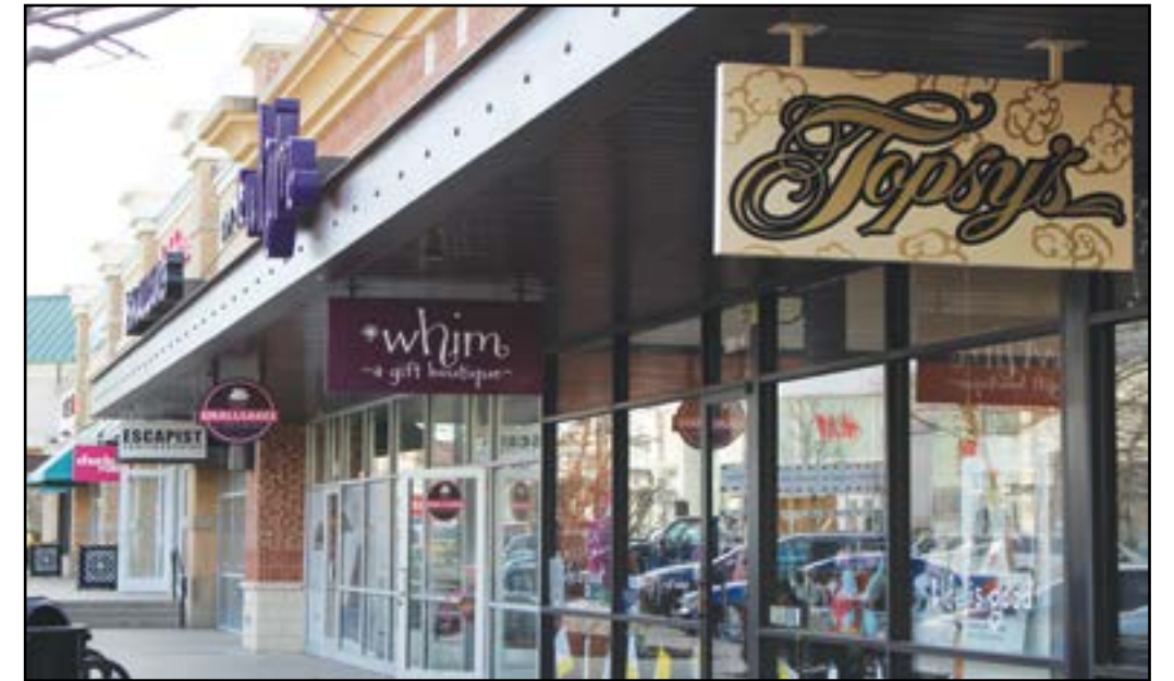
The Summit Fair Shopping Center is set up similarly to how the new Olathe Outlet Mall will be constructed.

Their new plans will be overshadowing the last mall, which emphasized convenience with 160 stores, a 16-screen movie theater and four rest areas. It had a large food court that was decorated with carpets and posters surrounded by a