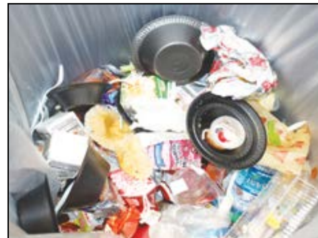
The trash can in the lunchroom after fourth lunch full of wasted food.

Whatever the reason, the amount of food thrown away on a daily basis is a concerning issue in America. It is wasted money, with fairly simple solutions. The hard part is acting on these potential food waste solutions and turning them into good results for a better future.