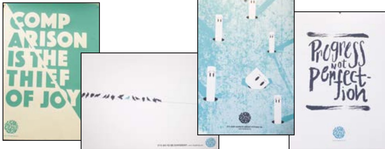
Recently, LSN has hung a variety of posters encouraging the "You Be You" idea, including these four.

LSN has begun a new program called "You Be You" and it is all about accepting yourself, others and bringing this school together as a whole. "You be You" is a sponsored program for schools to help with self-worth and unity.