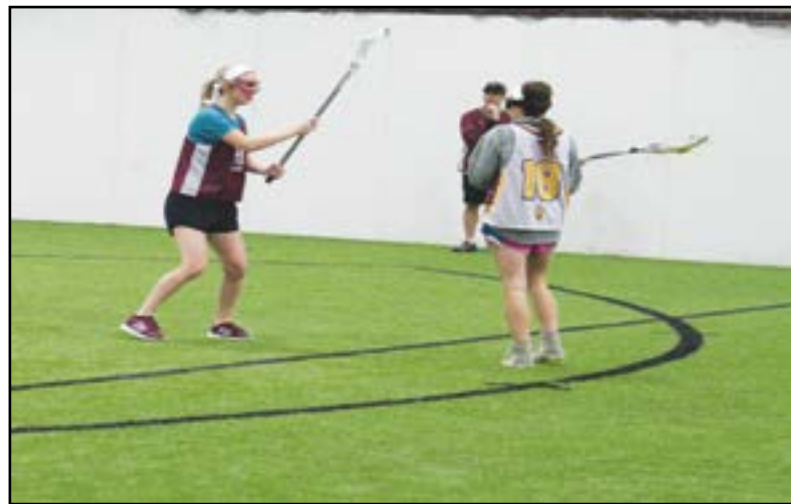
Girls lacrosse team conditioning for the upcoming season.

To add, not all students are new to trying out for a school sport. Some students have already gone through the process and know what