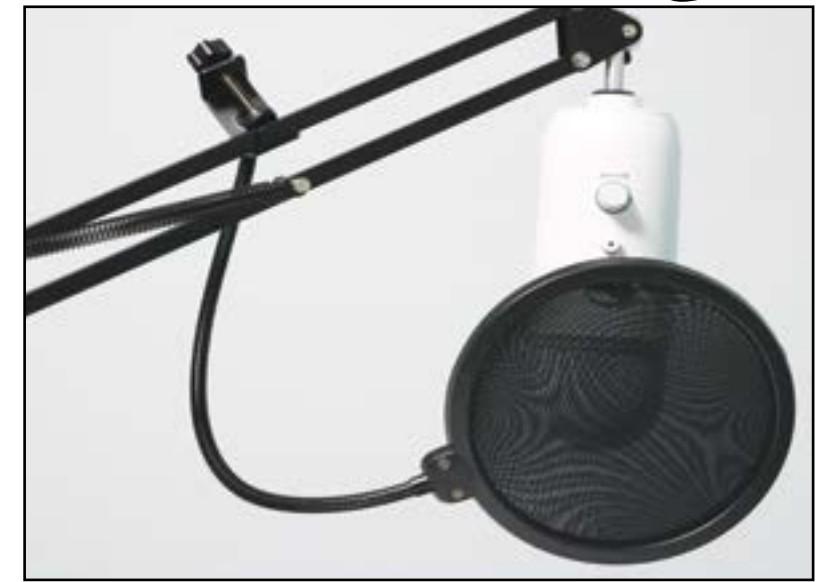
A Blue Yeti microphone set up; a common microphone for most podcasts.

"I think podcasts are nice, and, on occasion, you could