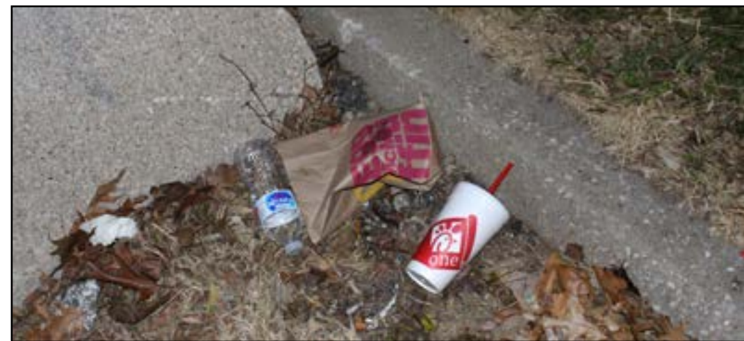
Trash at a skate park pollutes Downtown Kansas City.

If humans continue to destroy the Earth, there will not be much left for use in the future. Therefore, focusing on enhancing the Earth now, will ultimately establish a better Earth, not only for humans, but for all living things.