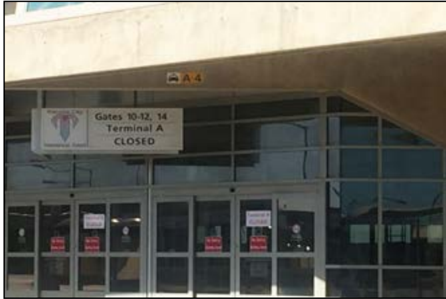
Terminal A at the Kansas City Airport closed getting ready for reconstruction.

Kansas City International Airport has been around since 1972, and has only been remodeled once since then. On Tuesday, November 7, question one on the Kansas City ballot was passed for a new KCI design. The new design will be a single terminal airport with 35 gates, two stories, and even a large two story fountain.