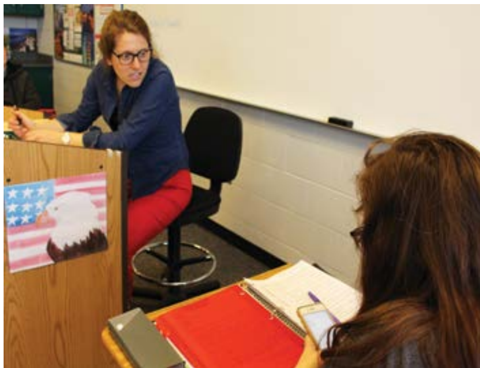
Students ignore teacher while on phone during a lecture.

Whether or not phones should be out in the classroom is usually at the teacher's discretion. Most times, at least in my classes, students are pretty good about staying off their phones while class is going on. There also is not much service in the school, so when students are on their