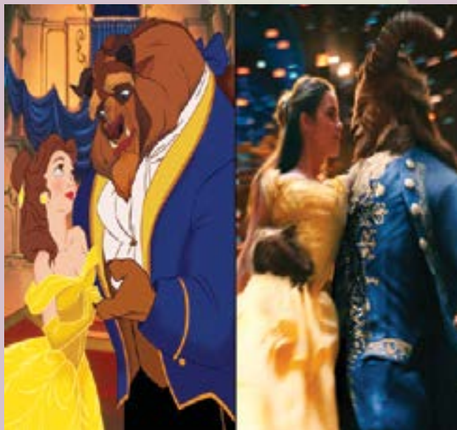
A remake of the Disney classic Beauty and the Beast opens in theaters March 17th 2017.

The Beauty and the Beast is unleashed in theatres across the nation on March 17.